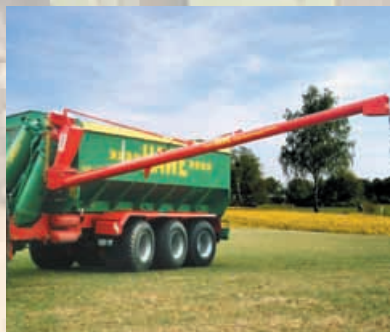
Hydraulic positioning of seed auger for seed drill combinations of over 6 m working width

HAWE field transfer trailers are key implements in professional grain harvesting. They enable on-the-go grain transfer from combines thus increasing combine-harvesting capacity by as much as 25 percent. The running gear design and tyres help prevent deep tracking and soil compaction