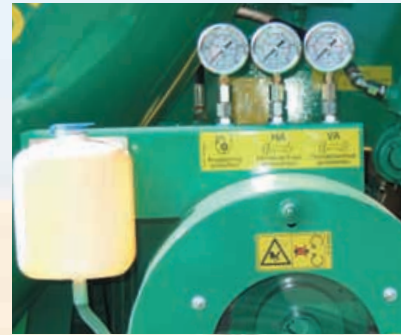
Sight control for the most important functions