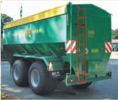
Rolling-up and unrolling of trailer cover from ground level (standard as from ULW 1500 E)