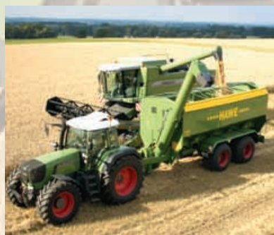
.... with tandem axles or (special paintwork) ...