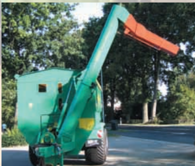
Hydraulic positioning of seed chute for filling seed drills of up to 6 m working width