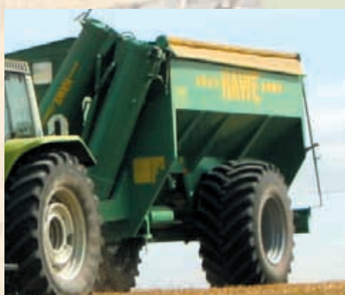
Field transfer trailers with one axle....

assembly guarantee operational reliability, performance, operating ease and long working life.