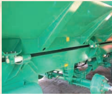
Load-weighing rods for load-weighing system (optional)