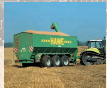
... with triple axles (standard equipment)