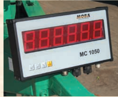
Weighing computer display for tractor cab