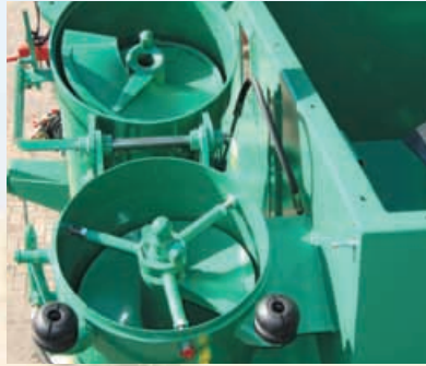
Large diameter unloading auger with central bearings and powerful drive